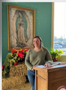
Women's Day of Reflection