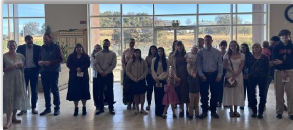
"Rite of Welcome" Candidates & Catechumens

Do you know someone who is interested in becoming Catholic or who might be interested in learning more about the Catholic teachings and what the Catholic Church is all about? Do you know a Catholic who has "fallen away"